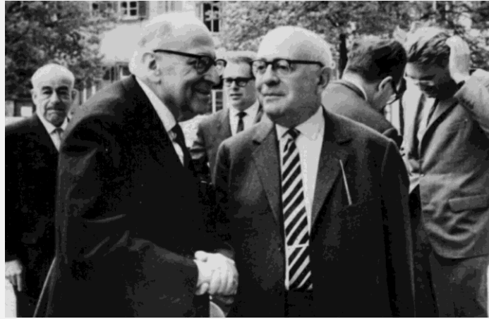
Frankfurt School Adorno and Horkheimer